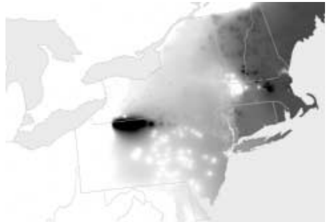
Figure 3 With New York to Vermont Limit Increased to 250 MVA

York. Free trade and competition alone are not enough to significantly reduce prices in New England: generators in NEPOOL may have substantial protection from distant competitors. But even in the case of New England, a limited number of investments in the electrical grid could significantly reduce prices.