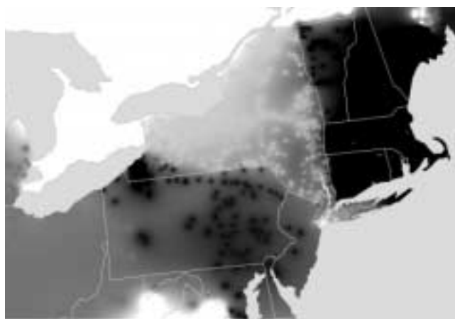
Prices Under "Regulated Trade"

since. The goal of the OPF is the minimization of total generation costs subject to the physical limits of the grid and generators to produce and transport electricity. Over the years a wide variety of different solution approaches have been proposed. We use linear programming-based methods. The details of our algorithm are presented in our technical paper.