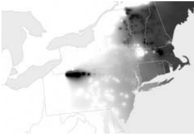
Figure 3 with New York to Vermont Limit Increased to 210 MVA

its in the transmission grid in the northeastern United States. The main results are as follows: