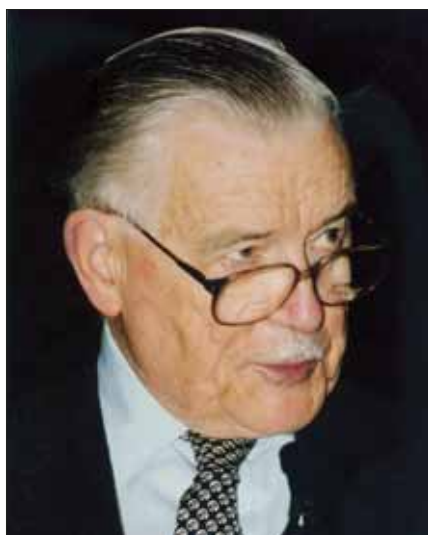
James M. Buchanan

conversation where ideas will be advanced, challenged, and refined in public view. Readers of Cato Unbound are encouraged to discuss the magazine’s themes on their own